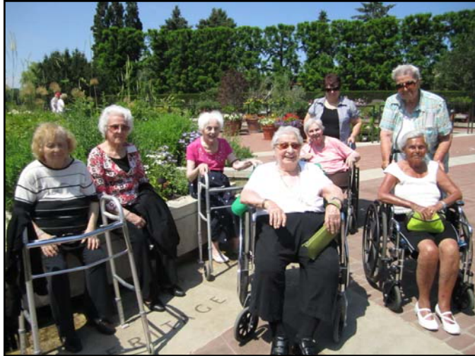
Residents spending a beautiful afternoon at the Chicago Botanic Garden