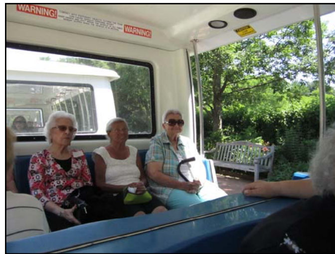
Residents taking a ride around the Botanic Garden in the Grand Tram