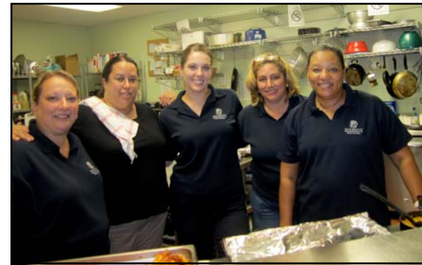
Department heads cooking and serving dinner for the women of Deborah's Place