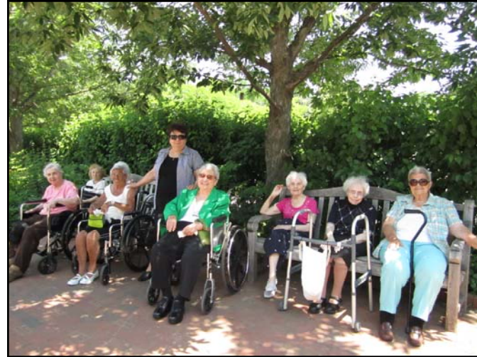
Residents and staff taking a break from touring the garden