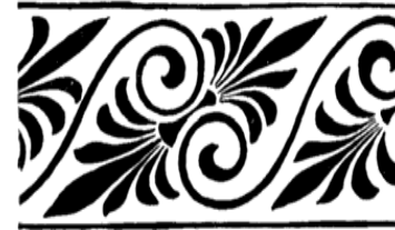
Residents enjoyed food and entertainment at the Greek Festivals.