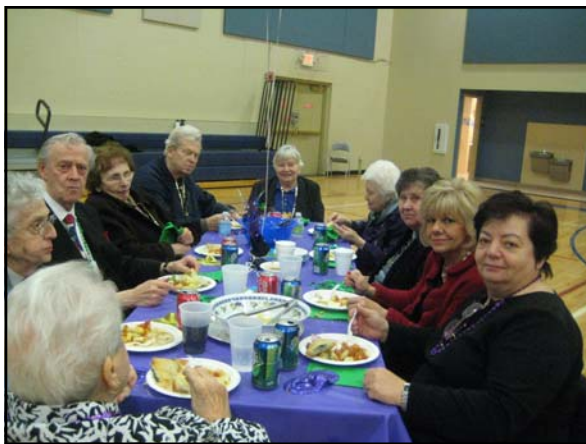
St. Nectarios Mardi Gras Dinner