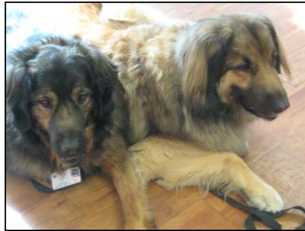
Therapy dog visits