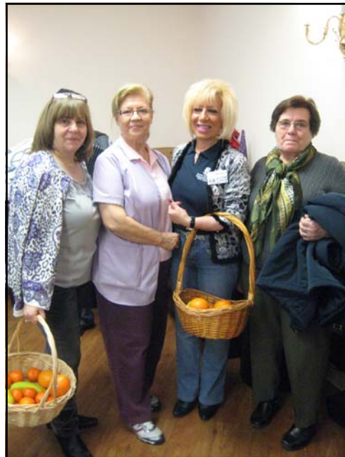
Pan Laconian Society Visit