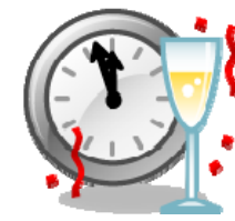
New Year's Party