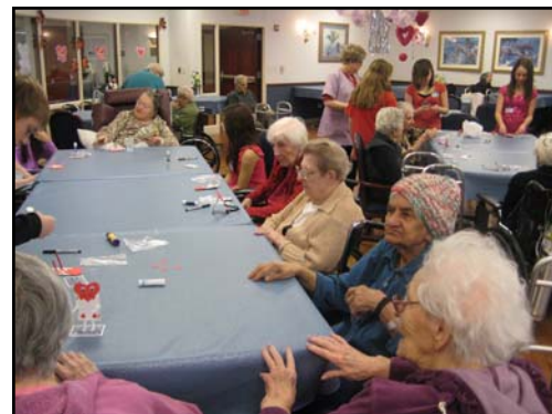
Valentine's Day Social

Thank you for your continued love and support.