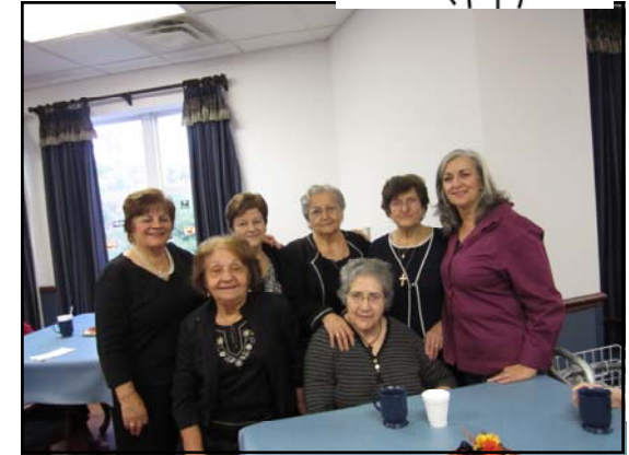
Residents enjoyed spending their afternoon with friends from St. Demetrios of Elmhurst. The sweets were delicious!