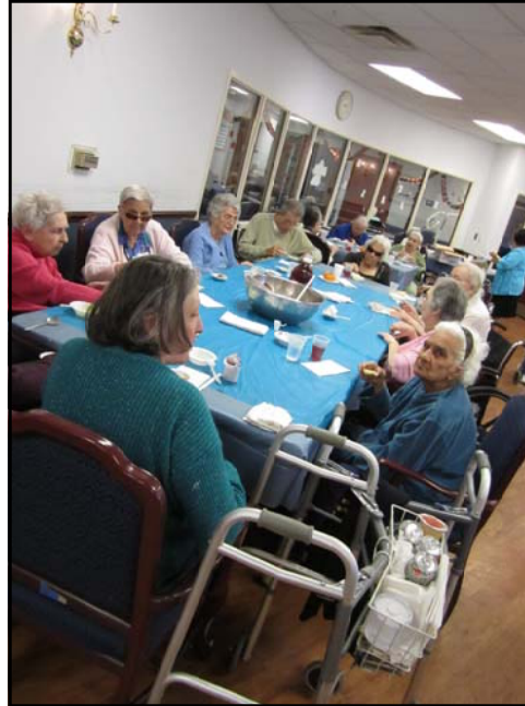
Residents spend the afternoon cooking and baking delicious treats for everyone to enjoy!