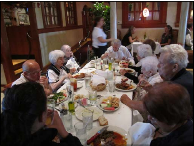
Residents look forward to our monthly visit to Demetri's Restaurant. The food is always outstanding!